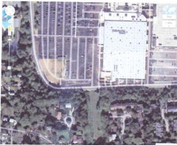
Proposed Wheaton station

Costco continues to reference other gas stations as examples of why the Wheaton gas station should not be a concern, however when you look at the siting of other Costco gas stations, you can see that none is as close as the Wheaton site. The siting of Montgomery County's largest gas station so close to an existing neighborhood with homes built as long as 60+ years ago is disturbing. The fact that the County Council would put such a small price on the families, homes, and home values of this extremely diverse neighborhood is upsetting at best. .