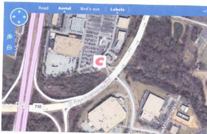
Glen Burnie, MD

There are numerous other concerns about this gas station, including the potential placement so close to a school for children with special needs. There are also social justice concerns considering that Wheaton is Montgomery County's most diverse area and may be the location of the largest gas station. The reasons NOT to place the gas station here are numerous. The reasons for the Costco gas station are limited to Costco and their desire to increase business (not a consideration for need) and the desire by residents for cheap gas (also not a consideration for need).